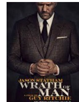
Wrath of Man