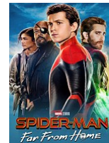
Spider- Man: Far From Home