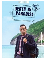
Death in Paradise