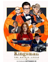
Kingsman: The Golden Circle