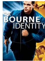
The Bourne Identity