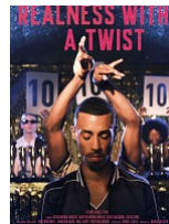
Realness with a Twist