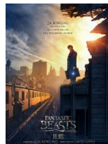
Fantastic Beasts and Where to Find Them