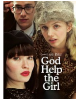
God Help The Girl