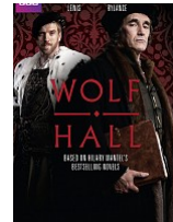
Wolf Hall: The Mirror and the Light