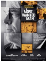
A Most Wanted Man