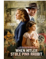
When Hitler Stole Pink Rabbit