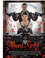
Hansel & Gretel: Witch Hunters