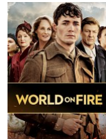
World on Fire