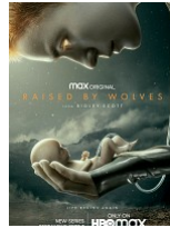
Raised by Wolves