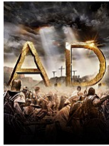
A.D. The Bible Continues