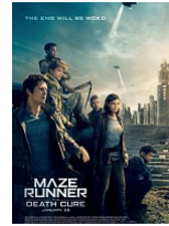
The Maze Runner: The Death Cure