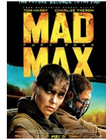
Mad Max: Fury Road