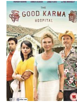
The Good Karma Hospital