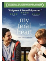
My Feral Heart