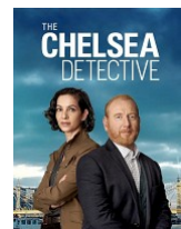
The Chelsea Detective