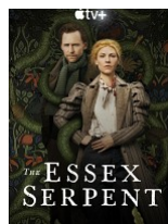
The Essex Serpent