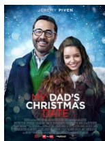
My Dad's Christmas Date