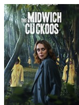
The Midwich Cuckoos