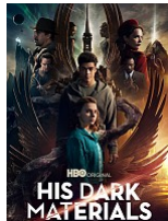
His Dark Materials