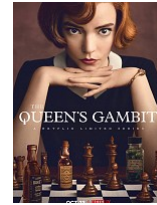
The Queen's Gambit