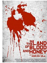
In the Land of Blood and Honey