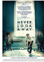
Never Look Away