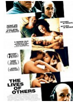
The Lives of Others