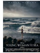
Young Woman and the Sea