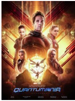
Ant-man and the Wasp: Quantumania