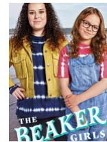
The Beaker Girls