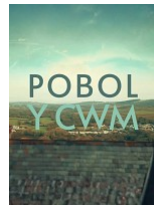
Pobol Y Cwm