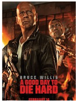
A Good Day to Die Hard