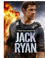
Tom Clancy's Jack Ryan