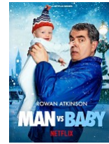
Man vs Baby