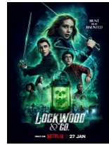
Lockwood &amp; Co