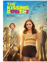
The Kissing Booth 2