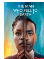
The Man Who Fell to Earth