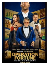
Operation Fortune: Ruse de guerre