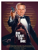
No Time to Die