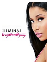
The Night is Still Young