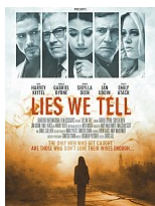
Lies We Tell