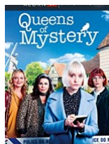
Queens of Mystery