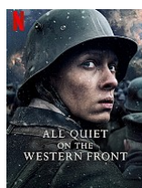
All Quiet on the Western Front