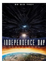
Independence Day: Day: Resurgence