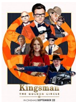
Kingsman: The Golden Circle