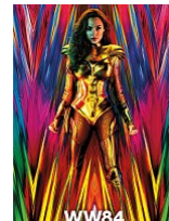
Wonder Woman 1984