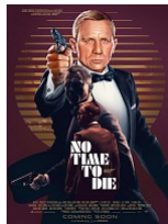
No Time to Die