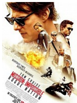
Mission: Impossible - Rogue Nation