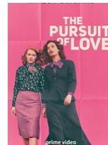
The Pursuit of Love