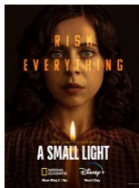
A Small Light