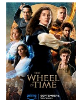
Wheel of Time