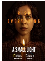
A Small Light