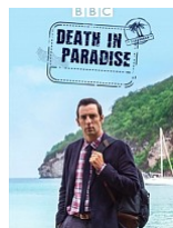
Death in Paradise