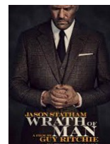
Wrath of Man