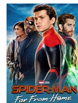
Spider- Man: Far From Home