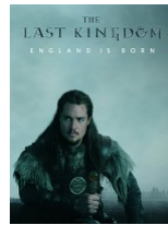
The Last Kingdom