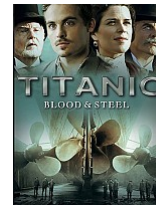
Titanic: Blood and Steel