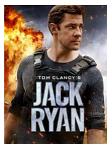
Tom Clancy's Jack Ryan