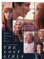
The Lost Girls