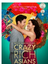
Crazy Rich Asians