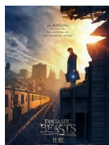
Fantastic Beasts and Where to Find Them