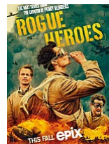
SAS: Rogue Heroes