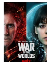
War of the Worlds