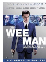
The Wee Man