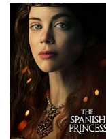
The Spanish Princess