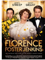
Florence Foster Jenkins