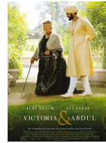
Victoria & Abdul