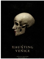
A Haunting in Venice