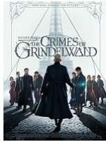
Fantastic Beasts: The Crimes of Grindelwald