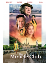
The Miracle Club