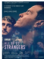
All of Us Strangers