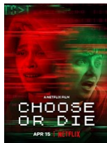
Choose Or Die