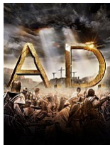
A.D. The Bible Continues