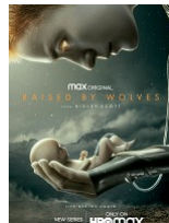
Raised by Wolves