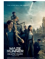
The Maze Runner: The Death Cure