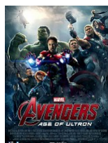
Avengers: Age of Ultron