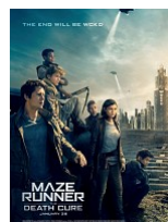
Maze Runner: The Death Cure