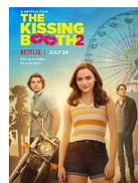
The Kissing Booth 2