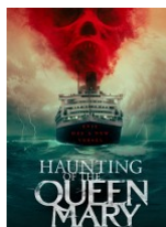
Haunting of The Queen Mary