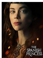
The Spanish Princess