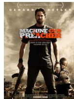
Machine Gun Preacher