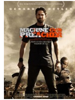
Machine Gun Preacher