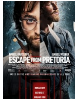
Escape From Pretoria