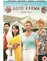
The Good Karma Hospital