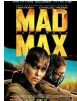
Mad Max: Fury Road