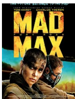
Mad Max: Fury Road