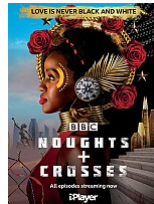
Noughts + Crosses