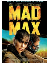
Mad Max: Fury Road