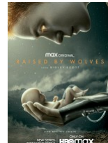
Raised by Wolves