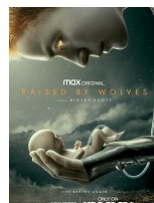
Raised by Wolves