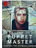
The Puppet Master: Hunting the Ultimate Conman