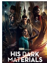
His Dark Materials