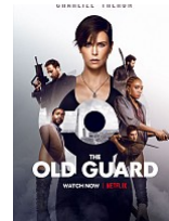
The Old Guard