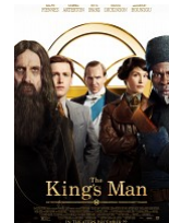
The King's Man