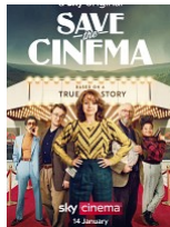
Save the Cinema