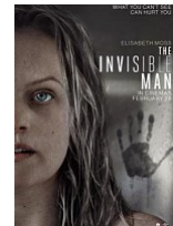
The Invisible Man