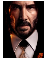
John Wick: Chapter 4