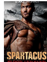
Spartacus Blood and Sand