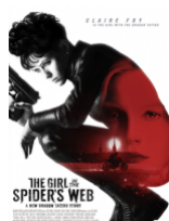
Dragon Tattoo: The Girl in the Spider's Web