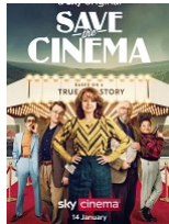
Save the Cinema