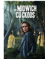
The Midwich Cuckoos