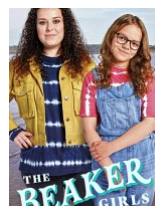
The Beaker Girls