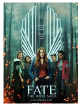
Fate: The Winx Saga