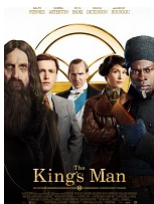
The King's Man