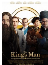
The King's Man