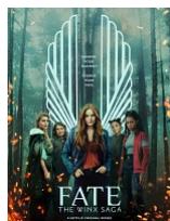
Fate: The Winx Saga