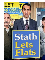
Stath Lets Flats