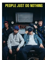
People Just Do Nothing