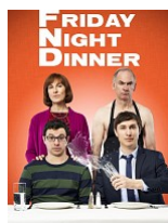
Friday Night Dinner