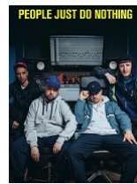
People Just Do Nothing