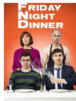
Friday Night Dinner