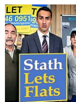
Stath Lets Flats